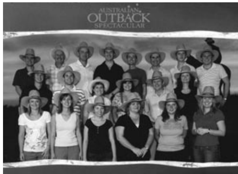
A Qasco Brisbane office survey section social function. The photo includes nine Germans.

More information about Qasco can be found at www.qasco.com.au